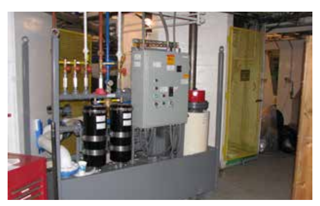
New LE-designed lube system installed and running.